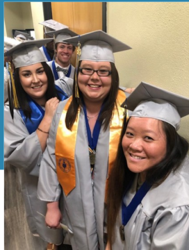
Recognition during graduation event