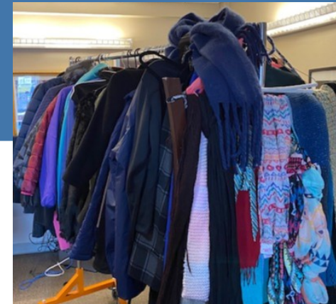
Raider Rack & Annual Coat/HUGS Giveaway