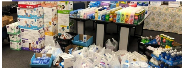
Expansion of our food pantry to offer healthier snacks for families and other household items