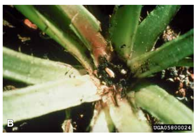
Figure 8. The rosette weevil (a) is smaller than the head weevil (See Figure 7a). Feeding of the rosette weevil can lead to less competitive, multiple-stemmed plants that produce fewer seed, or even destruction of the musk thistle growing point (b).