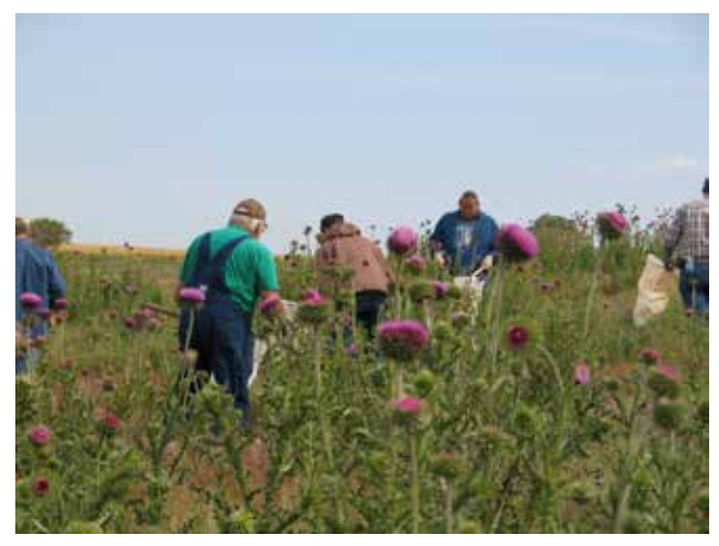
Figure 9. Musk thistle "weevil roundups" are conducted during spring when weevils are active.