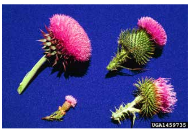
Figure 1. Flower heads of the invasive thistles present in Oklahoma musk thistle (top left), bull thistle (top right), Canada thistle (bottom left) and Scotch thistle (bottom right).