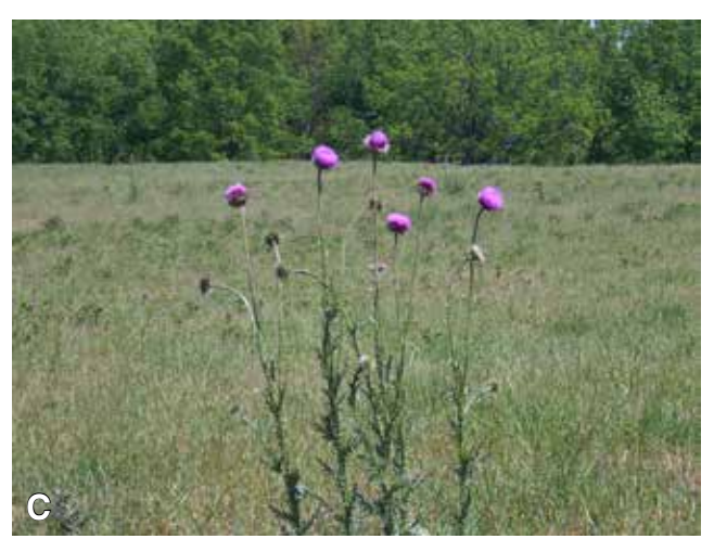
Figure 3. Musk thistle seedlings (a) can emerge in the fall and behave as an annual weed or in the spring and behave as a biennial weed. The rosette leaves of annual musk thistle plants (b) (i.e. emerging in the fall) are not as deeply lobed or spiny as the leaves of the biennial plants. Biennial musk thistle plants (c) can produce more than 10,000 seeds per plant. The flower heads of musk thistle (Figure 1) are deep rose to purple and powder-puff shaped.