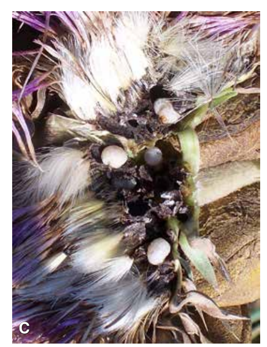
Figure 7. The thistle head weevil (a) is larger than the rosette weevil (See Figure 8a). The head weevil lays eggs on bracts of newly emerged flower heads (b). When the eggs hatch, the larvae make their way to the young seed of the head, where they feed on and destroy musk thistle seed (c).