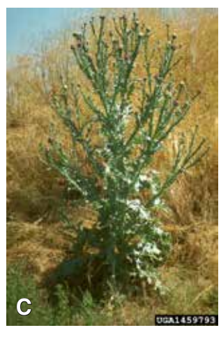
Figure 4. The leaves of seedling Scotch thistle (a) are densely covered with fine cotton-like hairs. During bolting (b) Scotch thistle leaves can grow to more than 12 inches in width before flowering (c). The reddish-purple flower head (Figure 1) is globe-shaped.