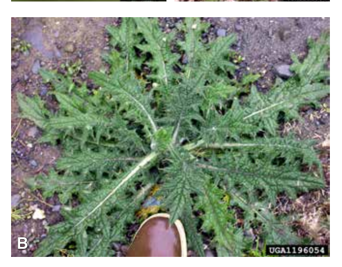
Figure 2. The leaf margins of a flowering bull thistle plant (a) are tipped with spines, and the stems have spiny wings. Bull thistle generally behaves as a biennial in Oklahoma, remaining in the rosette stage (b) for most of its life before bolting (c) The flower heads of bull thistle (Figure 1) are top-shaped and can be white to purple in color.