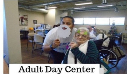
Adult Day Center