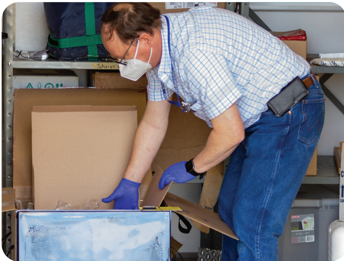
Moderna Vaccine Delivery - OSDH Warehouse

OSDH HAS INVESTED IN IMPORTANT LONG & SHORT TERM INITIATIVES