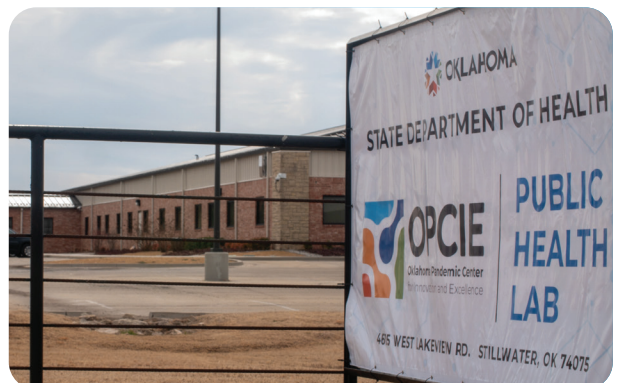
January 2021 - OK Pandemic Center and State Public Health Lab