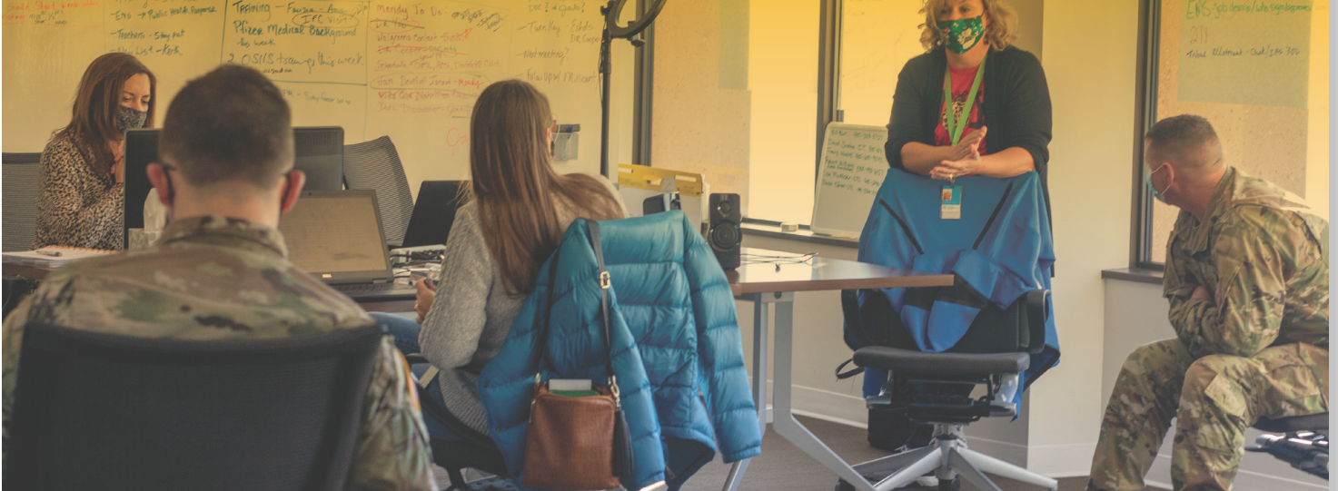
December 2020 - OSDH Situation Room