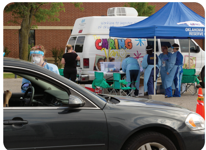
May 2020 - Drive-Thru Testing Caring Van