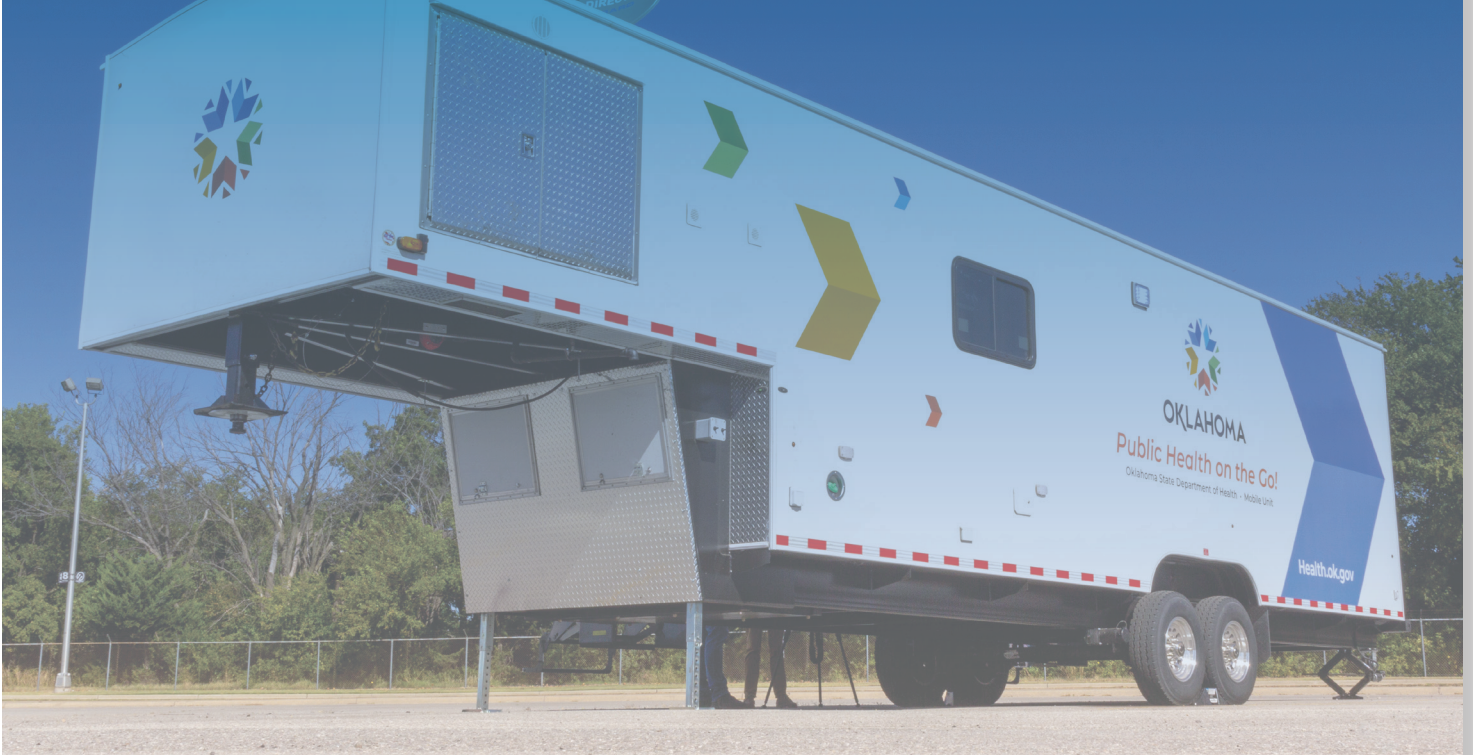
OSDH Mobile Health Unit