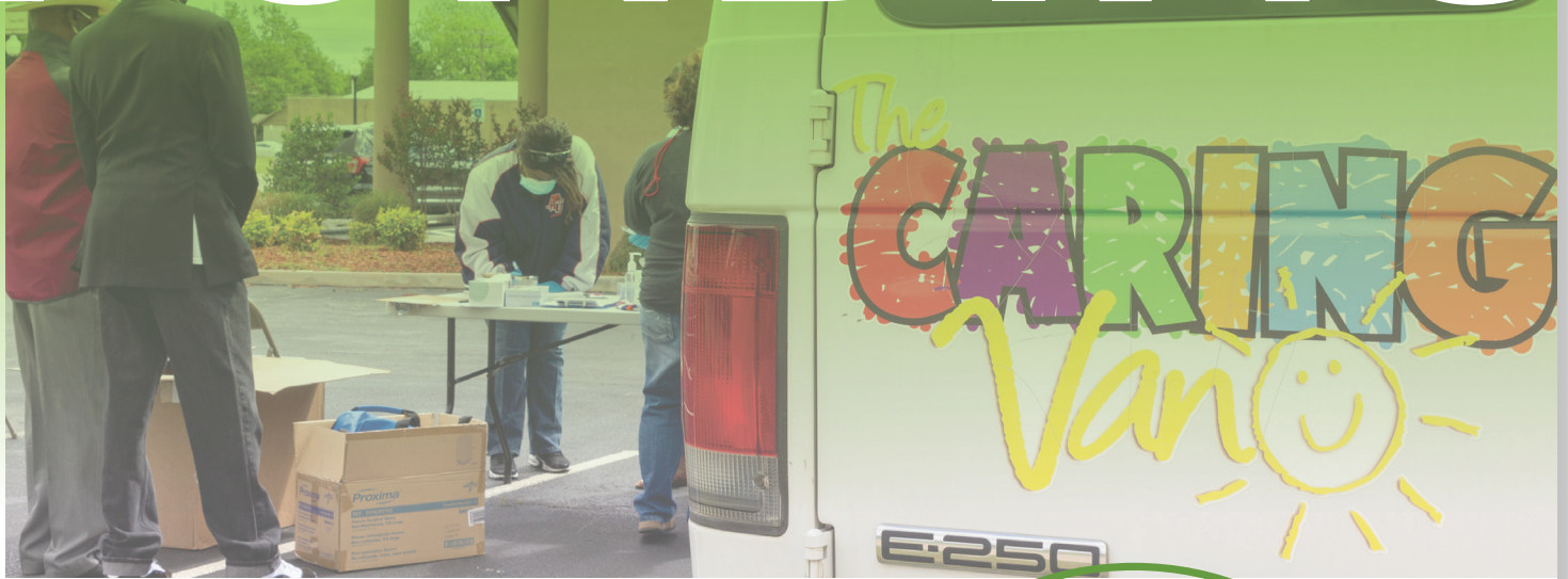
May 2020 - Drive-Thru Testing Caring Van