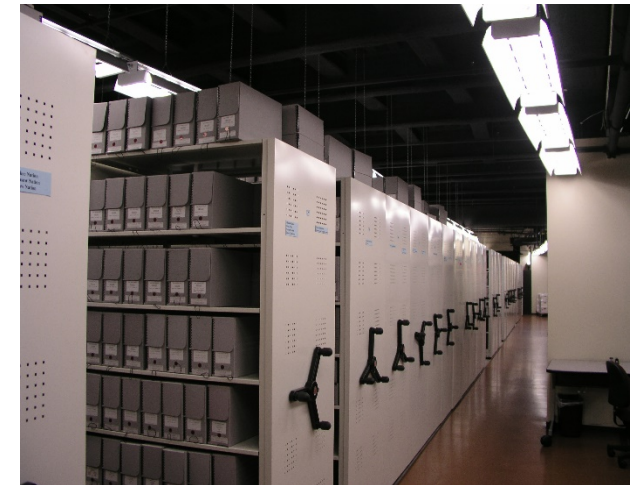
Manuscript Archive, Oklahoma History Center, Oklahoma City