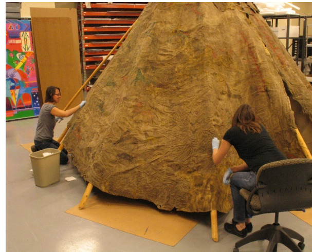
Bison Hide Tipi Conservation