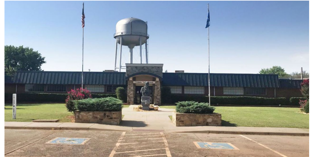
The Chisholm Trail Museum, Kingfisher, OK