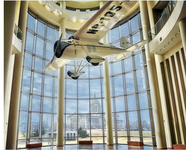
Oklahoma History Center, Oklahoma City