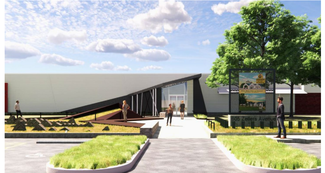
Proposed renovation of The Chisholm Trail Museum, Kingfisher, OK