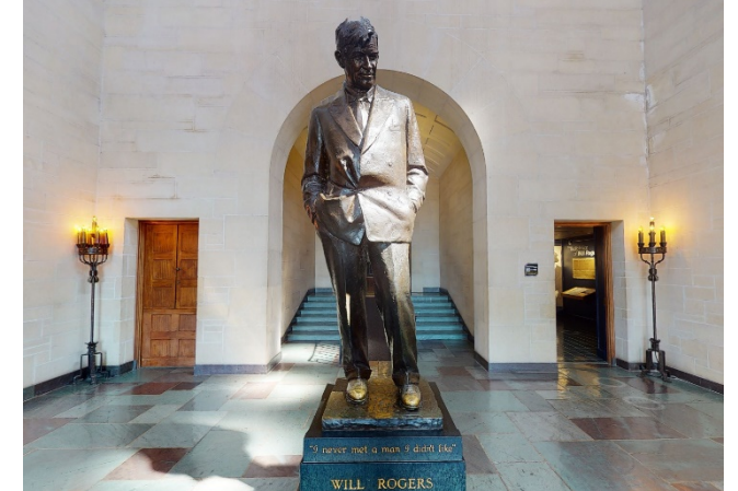
Will Rogers Memorial Museum, Claremore