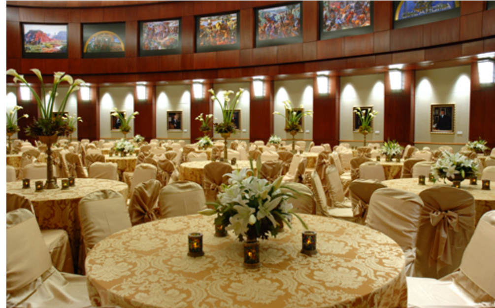
Chesapeake Event Center, Oklahoma History Center, Oklahoma City