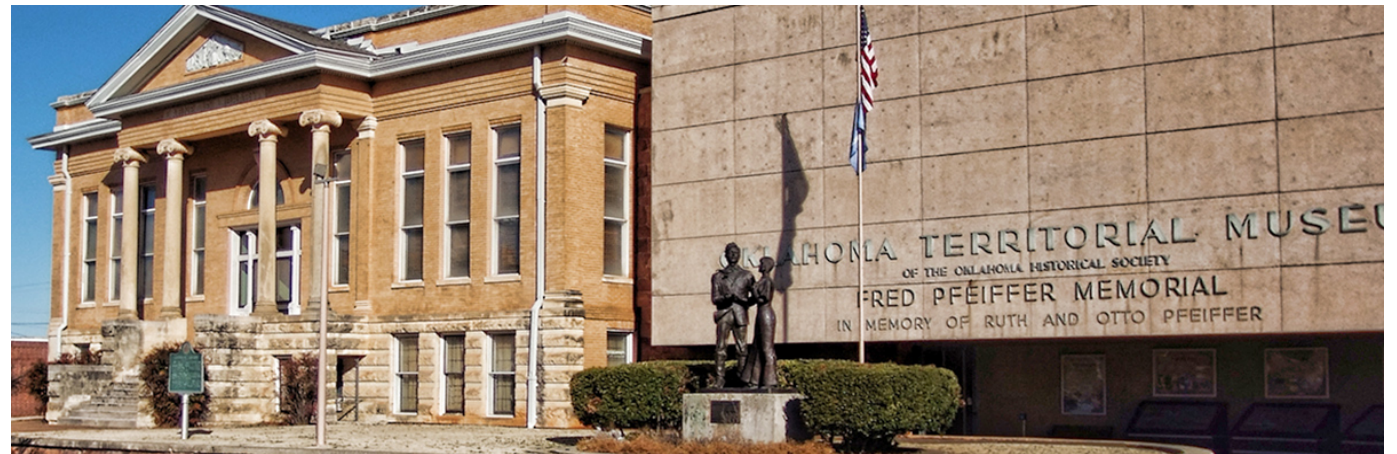
Oklahoma Territorial Museum, Guthrie