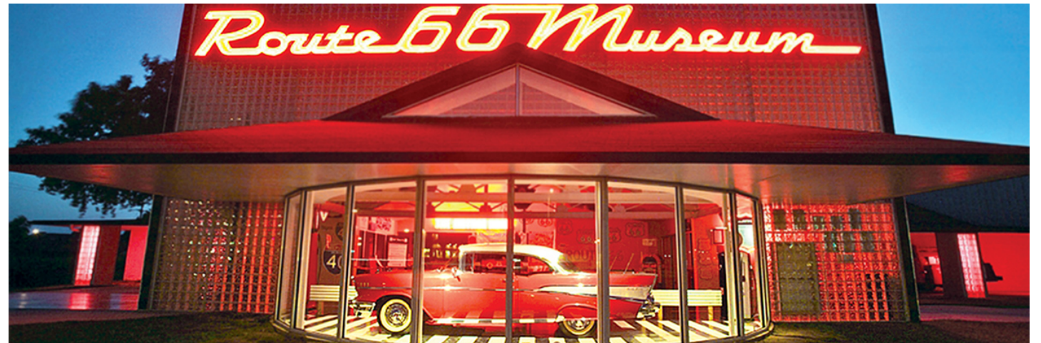
Oklahoma Route 66 Museum, Clinton