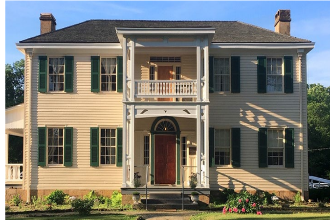
Hunter's Home, Park Hill